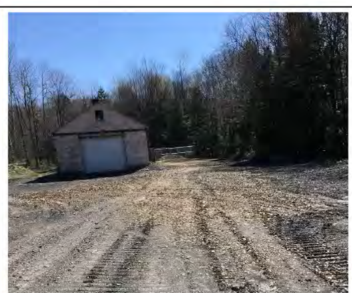
View from the entrance gate to the shaft.