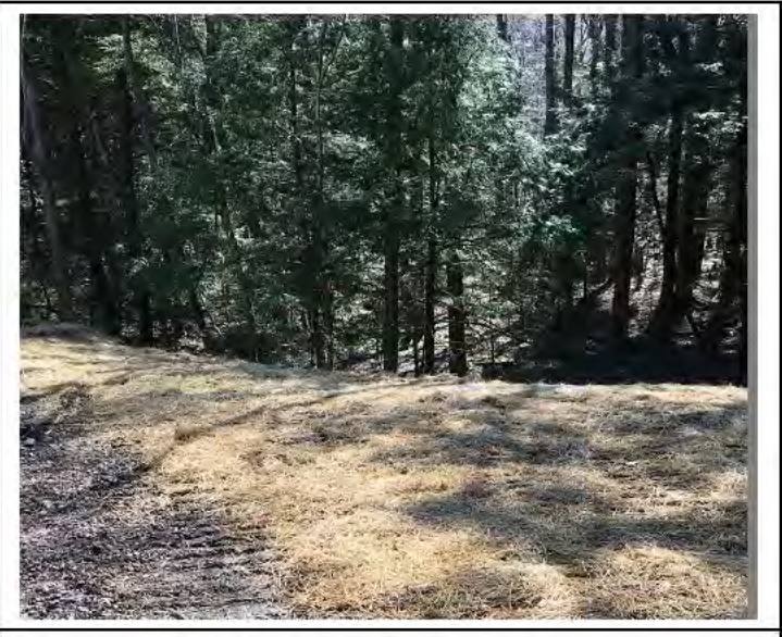
Seeded and mulched.