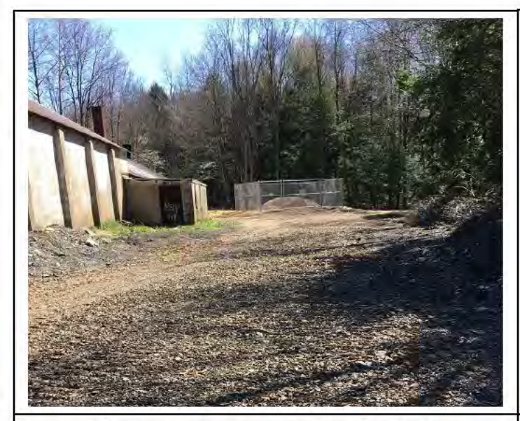
New aggregate entrance into the shaft.