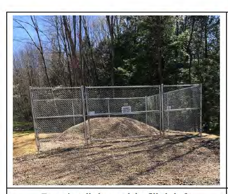
Fence installed around the filled shaft.