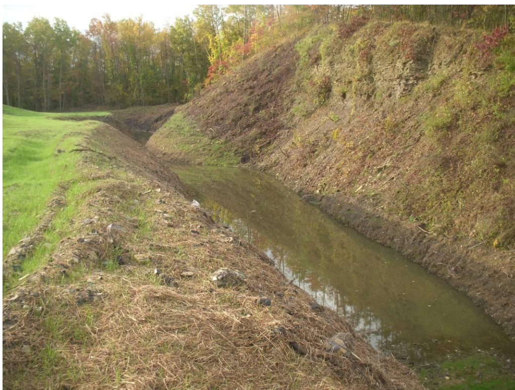
Completed isolation trench (2012-10-10)