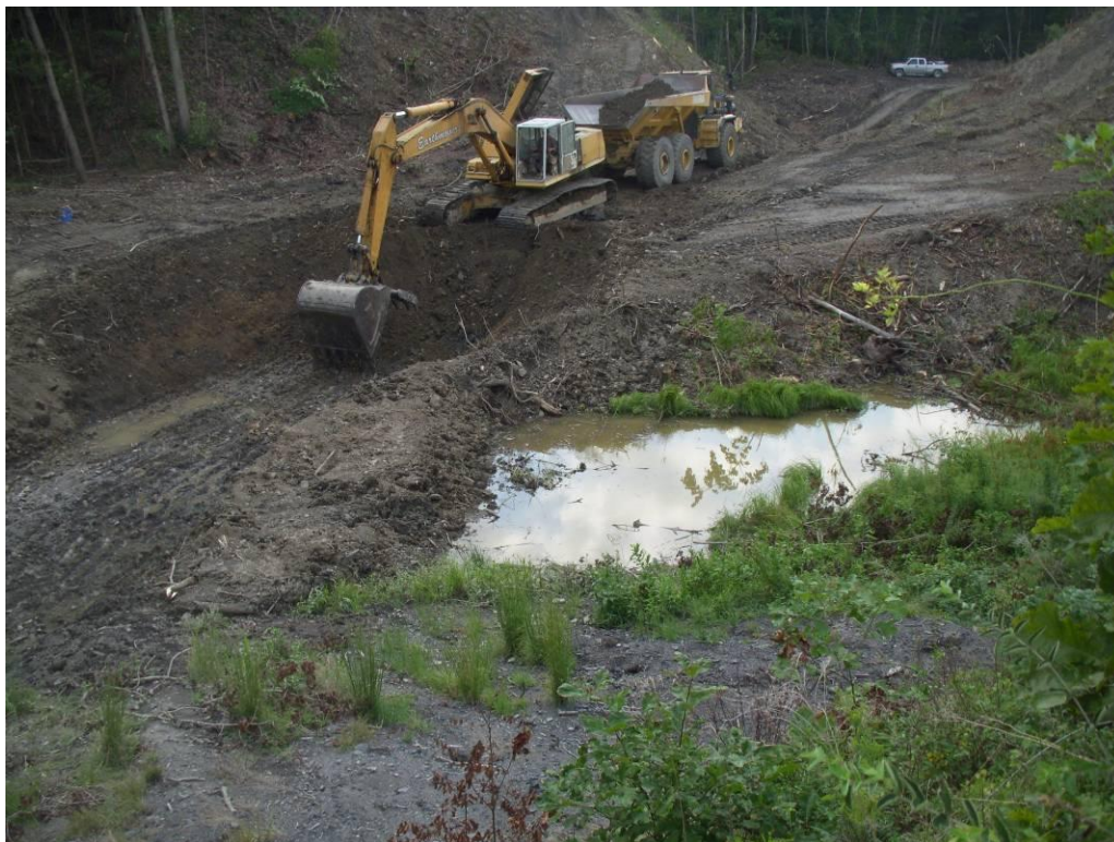
Trench excavation (2012-08-20)