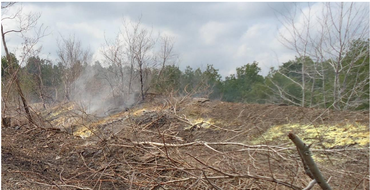
Burning surface spoil material on top of spoil pile (2012-05-23)