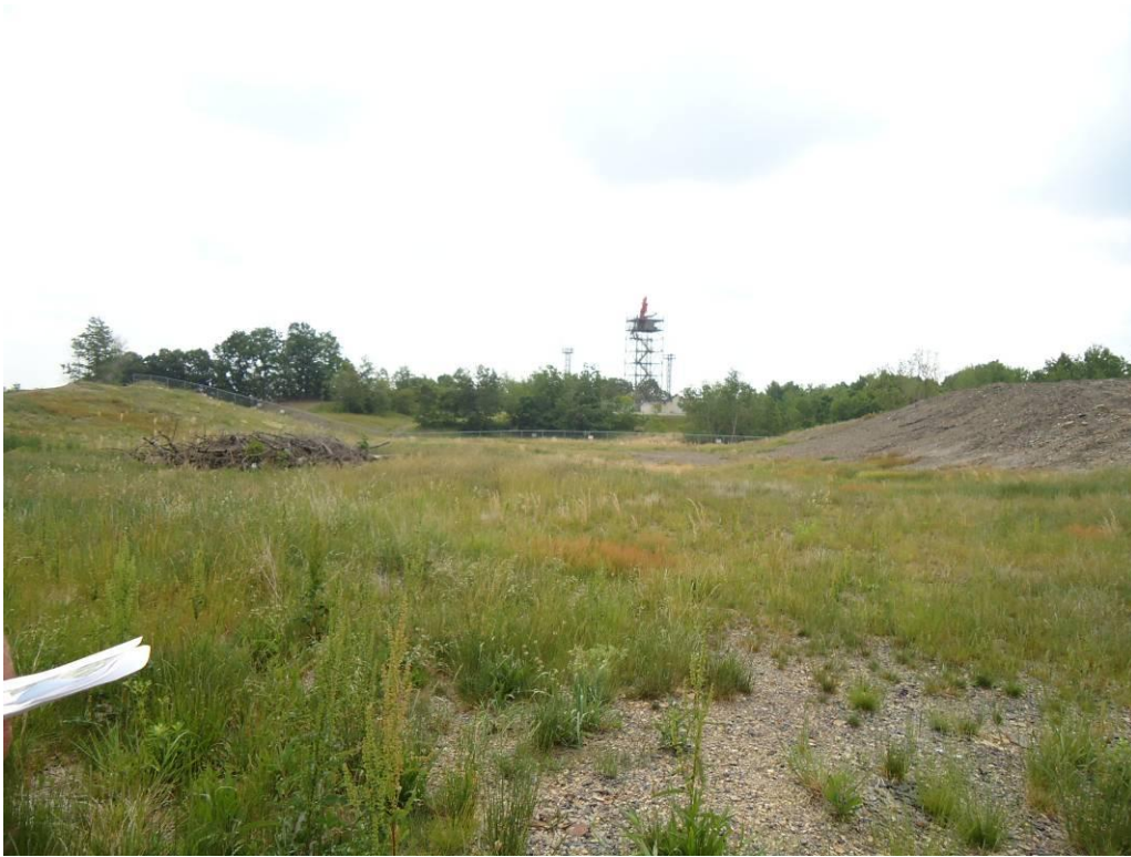
Radar tower facility and top of spoil pile (2012-05-23)