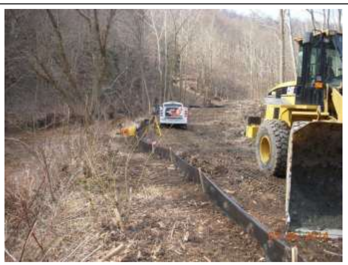
Contractor placing entrance road to job site under PA Turnpike bridge.