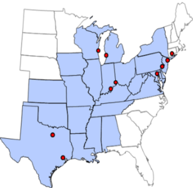
2021-2022 Receptors and Linked Upwind States