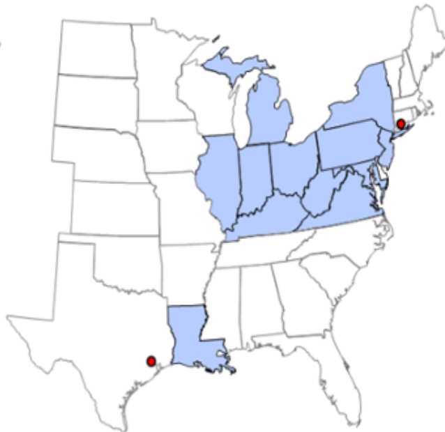
2023-2025 Receptors and Linked Upwind States*