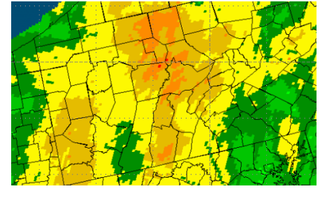
7 day precipitation 1

Over the past 7 days, Pennsylvania received between 1 and 5 inches of precipitation with the greatest depths in two areas -in the central and southwest as shown in the graphic.