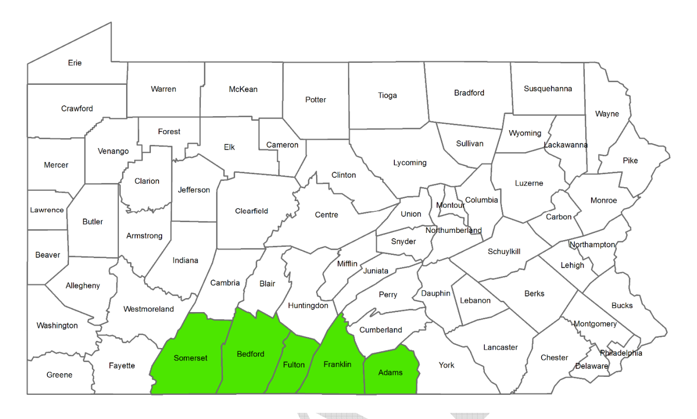
Figure 3. Counties included in remote sensing pilot study, (green highlight).

The following types of practices, including the corresponding NRCS practice code, are being evaluated as part of the pilot: