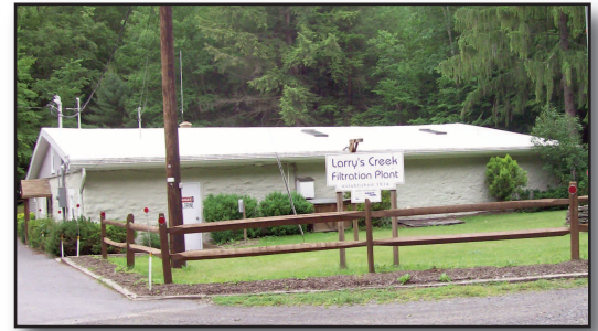
The Lorry's Creek Water Treatment Plant. Originally built in 1914, the plant has been exceptionally well maintained and updated