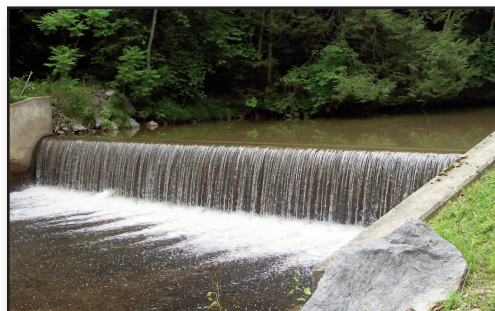
The dam on Larrys Creek. This dam was originally constructed from wood. The JSJWA replaced the wood with concrete in 1988.