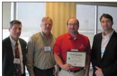
PA American at Summit

The summit moved quickly both days, run efficiently by the PA-AWWA staff. Plans are underway for a similar event in 2013