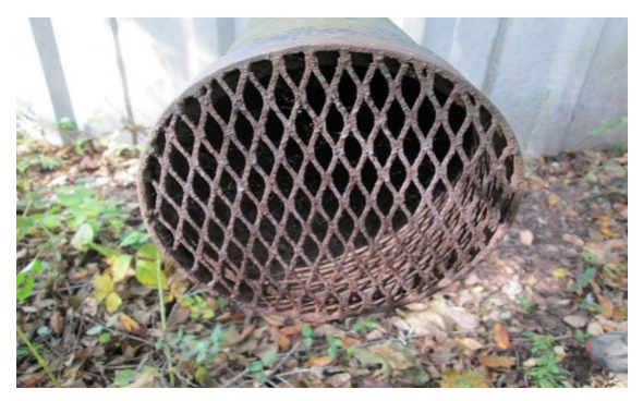
Figure 1: A storage tank overflow grate with large openings

Why is this important? Screens protect storage tanks from contamination due to entry of living organisms, including rodents, birds, and other small animals.