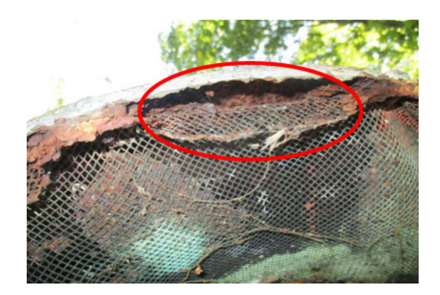
Figure 2: A storage tank overflow with a compromised screen

Giardia . It is important for public health protection to keep these disease-carrying insects out of finished water storage tanks. No-see-ums can be as small as 1 mm (0.039 inch). A 24-mesh screen with 0.0277-inch openings will prevent even these tiny insects from entering a ground level tank.