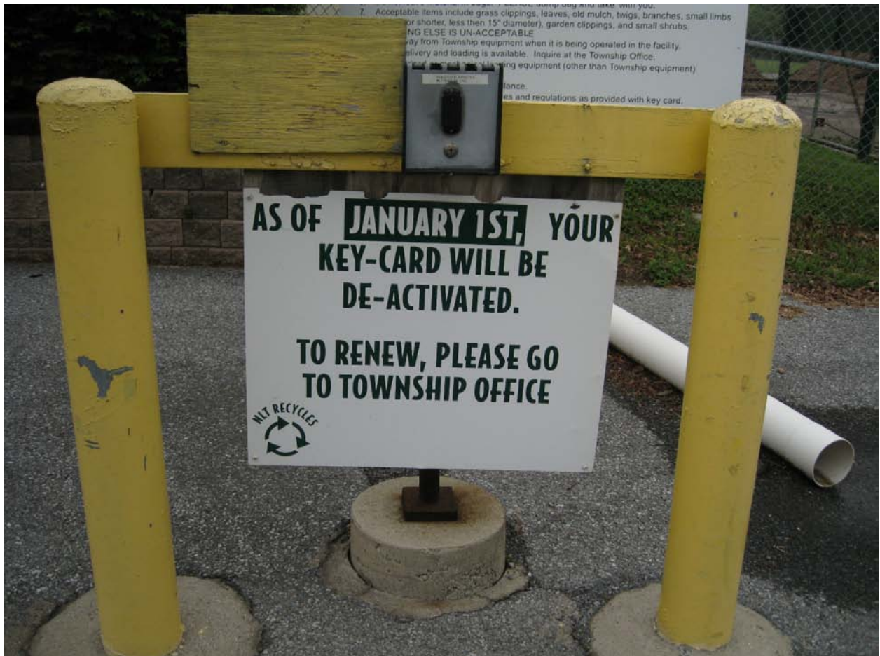
North Lebanon Township key card gate access swiping mechanism.

The Township initially issued 400 access cards at a cost of $1,056. Beginning in January each year, patrons buy a new card to access the site. 1,100 key cards were in use in 2012.