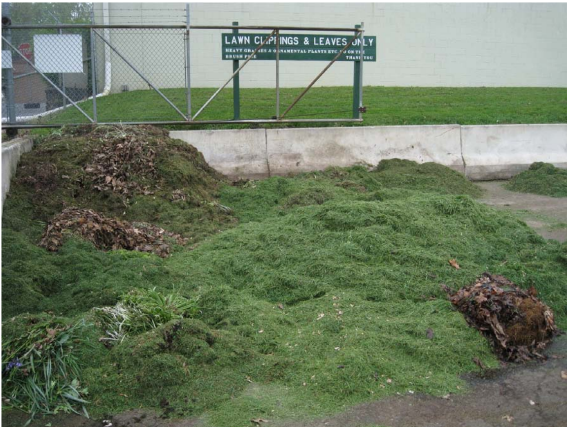
North Lebanon Township automated gate in open position.

After an initial grind, leaves and grass clippings dropped off at the site are added to the wood chips for a second grind that produces a mulch product. The mulch is free to any resident who has an access card. The Township charges a loading fee of $10/scoop for residents who don't or can't load mulch themselves. The Township also delivers mulch for a fee of $30 for three loader scoops or $70 for a six scoop truckload.