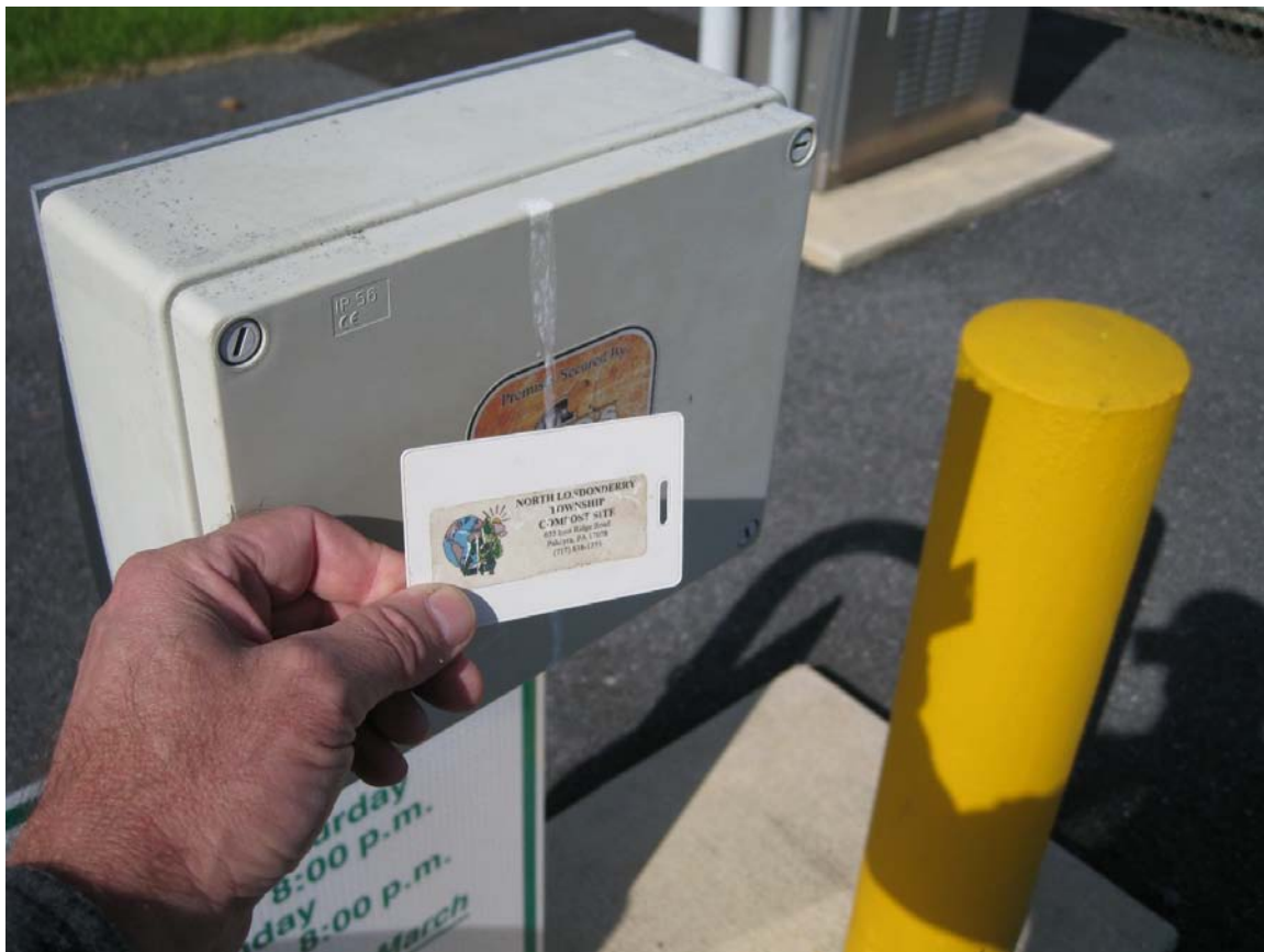
North Londonderry Twp. compost site access key card and swiping sensor.

The Township restricts access to the site to residents who pay a $25 annual registration fee. Those registering are provided with a plastic key card that opens an automated gate with a swipe of the card. The key cards are not available to the private sector as the facility does not accept commercial yard waste.