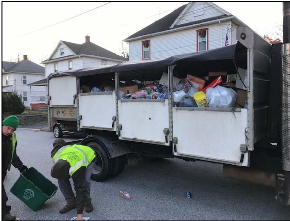
Picking-up Materials that Fall out of the Recycling Truck