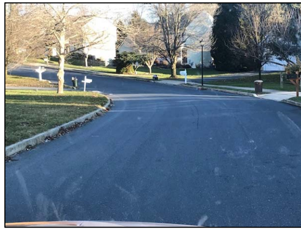
Residential Street in West Grove