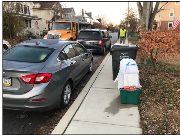
Recyclable Materials Placed Curbside