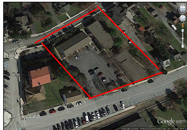
Image of Multi-Unit Housing in West Grove