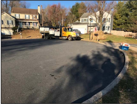
Recycling Collection in a Cul-De-Sac