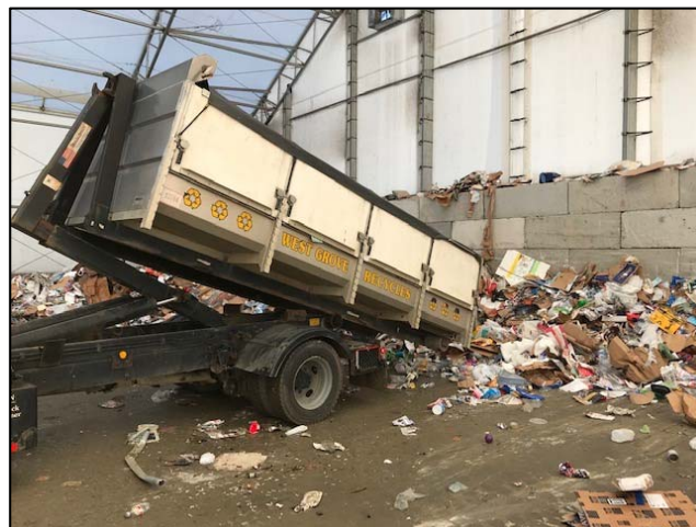
Unloading Recyclable Materials at SECCRA