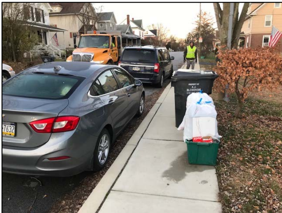
On-Street Parking Challenges

The Borough collects recyclable materials from some alleys. Based on SCS's field observations, it is difficult to ascertain if the alleys currently being utilized for recycling collection would be inaccessible to automated collection vehicles. In procuring automated collection vehicles, the Borough will need to evaluate its options and see if automated recyclable material collection could be feasible in alleys.