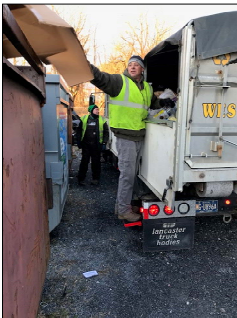
Unloading Large Items into Dumpsters at the Truck Yard