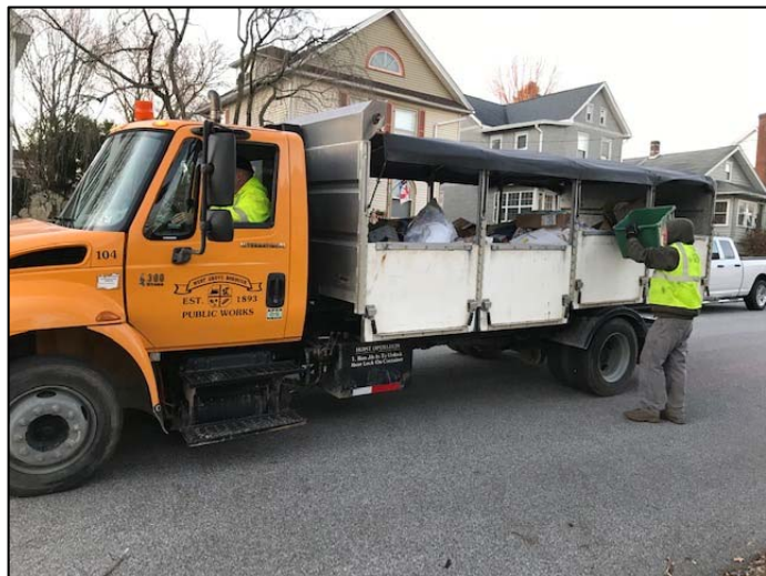
Recycling Collection in West Grove Borough

The site visit and field observations occurred over a one-day period in December 2019. This task was completed on a Wednesday prior to the holidays when normal recycling collection activities were completed. For much of the day, SCS staff rode along with Borough collection staff to observe collection operations and evaluate the physical characteristics of the Borough and their compatibility with an automated collection system. As part of the "ride-along," SCS obtained data from a number of residential collection points to understand how long collections take on a per household level.