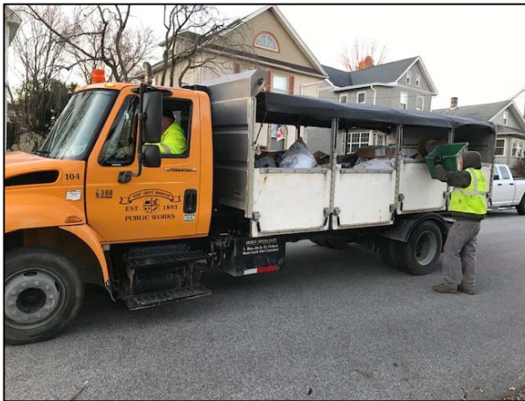
Unit 1 Collection Vehicle