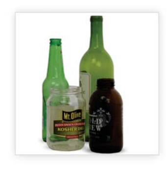
Bottles and Jars empty and rinse