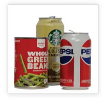
Aluminum and Steel Cans