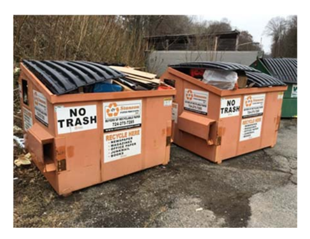
Containers for paper recycling behind the City garage

The City does not contract directly with recyclers for processing and marketing of their materials. The City receives pricing from local recycling companies on a regular basis and transports their recyclable materials to the vendor that will provide them the best price. With a limited number of material buyers and processors in the area, most metal and glass collected are delivered to PJ Greco