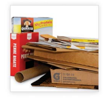
Cereal Boxes, Newspaper, Magazines and Mail, Flattened Cardboard & Paper Tubes