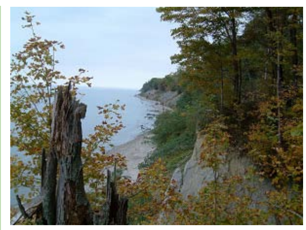
Pristine Lake Erie shoreline.

HARRISBURG, PA -- Grant applications are now being accepted for the preservation and protection of Pennsylvania's coastal zones along Lake Erie and the Delaware Estuary. This week, DEP opened the annual Coastal Zone Grant Program to fund projects to enhance these important natural resources.