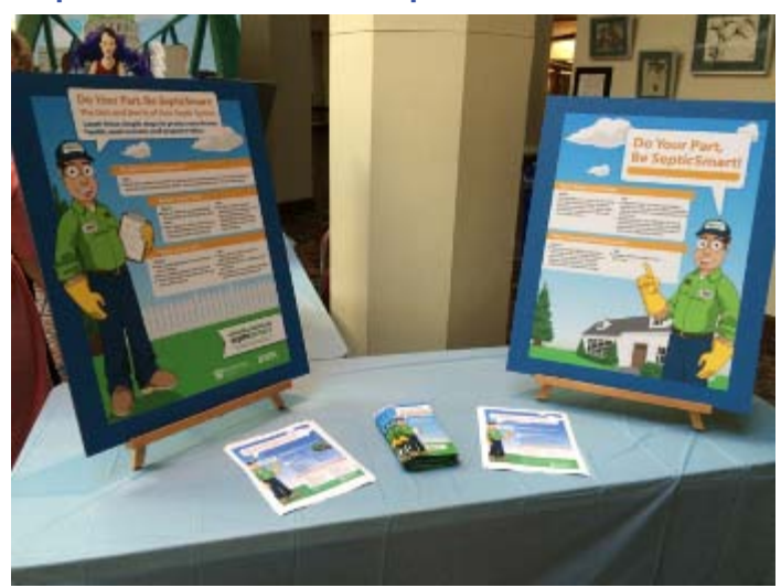
DEP staff provided information about the proper maintenance of septic systems at this booth in the State Capitol.

HARRISBURG -- DEP marked SepticSmart Week (Sept. 21-25) by reminding Pennsylvanians about the importance of onlot septic system maintenance. This annual initiative, led by DEP and the U.S. Environmental Protection Agency (EPA), encourages residents to learn about and properly maintain their septic systems.