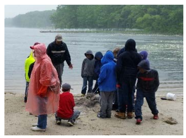
Students built and tested three kinds of dams at French Creek State Park.