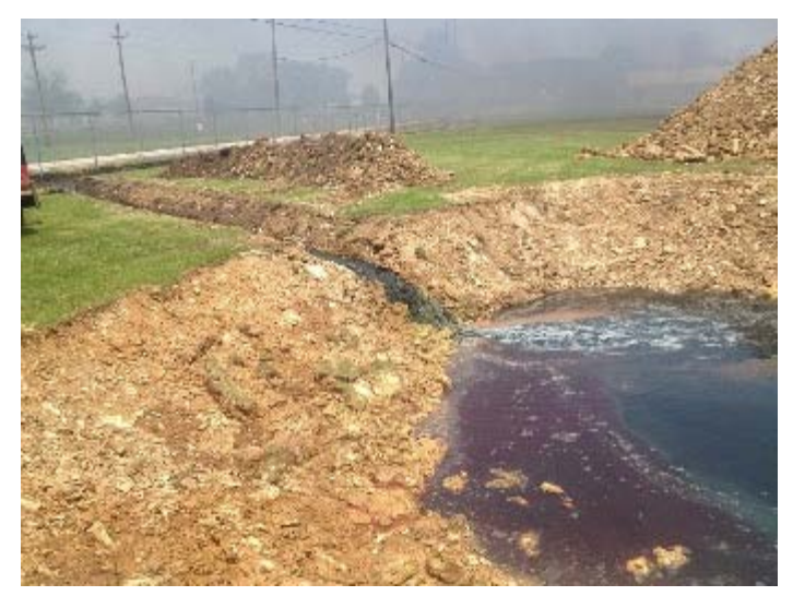
A trench and retention pond was dug to contain runoff from the fire.

HARRISBURG -- Cleanup efforts continue at the site of the June 8 fire at Miller Chemical, a fertilizer plant in Adams County.