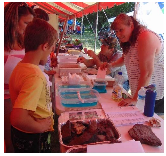
DEP staff working with the children showing hands on activities.

WILKES-BARRE - Staffers from DEP Wilkes-Barre manned an "interactive" table at RIVERFEST 2016 in Wilkes-Barre in June. The event celebrates the Susquehanna River and its importance to the region. Attendees were able see and touch some of the insects that DEP studies as part of the health of the river. They also got a chance to use tiny "booms" to clean-up an