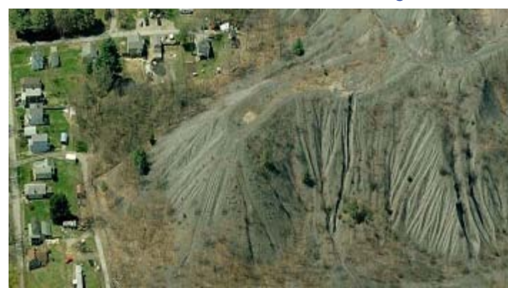
One of the 14 projects will reclaim this 45-acre coal refuse pile in Fredericktown, Washington County, that sits within 500 feet of 60

HARRISBURG -- Governor Wolf on July 15 announced the award of $30 million for 14 projects to reclaim abandoned mine lands (AML) in 10 Pennsylvania counties. The projects were selected for funding based on their potential to create long-term economic benefits in the coal communities in which they are located.