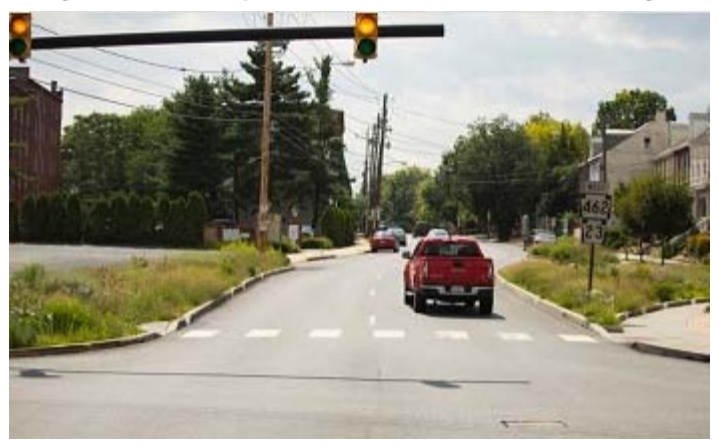
Vegetative curb extensions help cities like Lancaster reduce stormwater runoff.