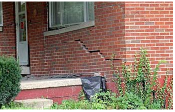
Since 1961, more than $28 million in claims have been paid to Pennsylvania homeowners.

PITTSBURGH -- DEP's Mine Subsidence Insurance (MSI)