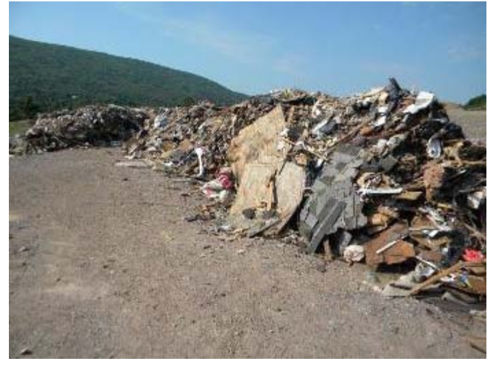
This illegal dump pile in East Penn Twp., Carbon Co. is one of six to be cleaned up this spring.

WILKES-BARRE -- DEP has hired a contractor to clean up six piles of illegally dumped waste scatterred throughout Carbon and Schuylkill counties after the responsible party has failed to complete the work.