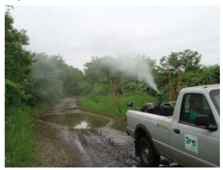
Crews conduct ultra-low volume treatment to control mosquitoes capable of transmitting West Nile Virus.

HARRISBURG -- Pennsylvania's first probable human case of West Nile Virus (WNV) infection in 2015 has been detected. A Venango county woman was hospitalized due to WNV. She has since been released from the hospital and is recovering at home.