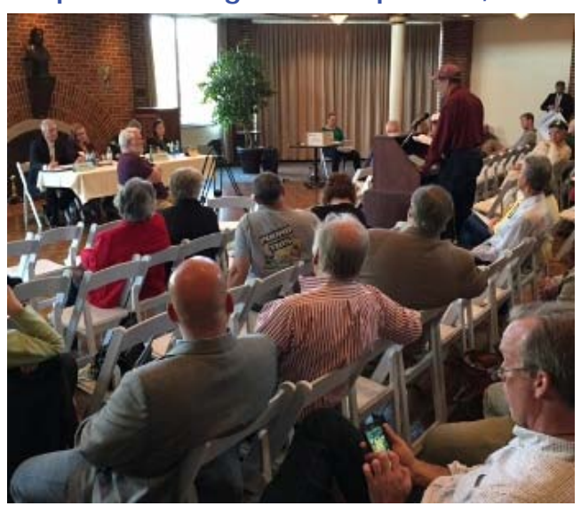
Fifty people testified at the first of three additional public hearings on proposed regulatory changes for oil and gas sites.

WASHINGTON -- Approximately 200 people attended the first of three additional public hearings to discuss revisions to the Environmental Protection Performance Standards at Oil and Gas Well Sites (Chapter 78 and 78a). The hearings were added to the recently-extended public comment period for the draft final rule. The first hearing was held April 29 at Washington and Jefferson College, Washington.