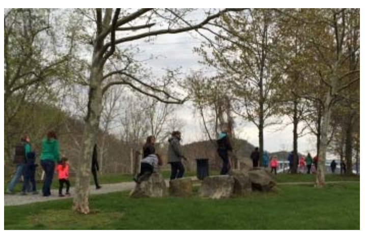
Children of DEP employees take a nature walk around Pittsburgh's Washington's Landing.

PITTSBURGH -- Staff from DEP's central and regional offices participated in the annual Take Your Child to Work Day on April 23.