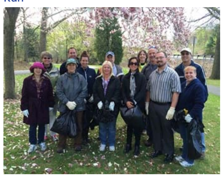
Volunteers from DEP's Southcentral Regional Office participate in the annual Earth Day Cleanup.