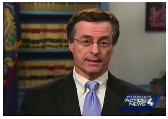
DEP Secretary John Quigley appears on Pittsburgh's WTAE Action News 4 to explain the administrative order.

PITTSBURGH -- DEP issued an Administrative Order on April 25 citing the Pittsburgh Water and Sewer Authority (PWSA) for making a substantial modification to its drinking water treatment system without prior approval by DEP. The change, which occurred in April 2014, involved the use of caustic soda in place of soda ash to control corrosion in PWSA's water distribution system. PWSA went back to the use of soda ash in January 2016.