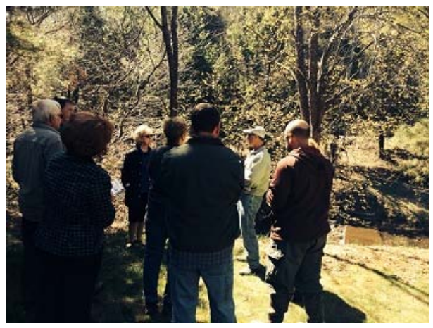
DEP Dam Safety Staff talk with members of the Chamberlain Lake Property Owners Association.

WILKES-BARRE -- DEP Dam Safety staff recently met with owners of private dams in Bradford and Wyoming counties to discuss the updates to regulations regarding dams. Dam Safety staff spent most of the day April 19th talking to owners of three dams about new specifications for height of dams, spillway pressure and bonding to own and maintain a dam in Pennsylvania.