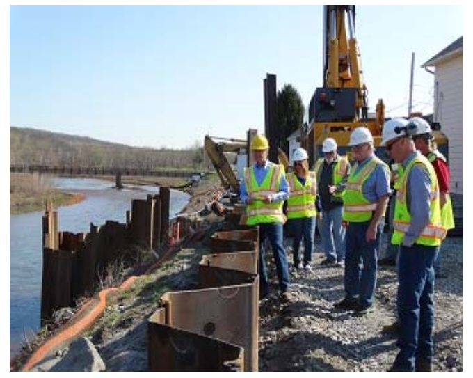
DEP staff look at the installation of 550 feet of wall that's part of the $1.5 million project.

DURYEA -- Staff from DEP's Northeast Regional Office recently got a look at the progress of work to build a levee system in the borough of Duryea, Luzerne County.