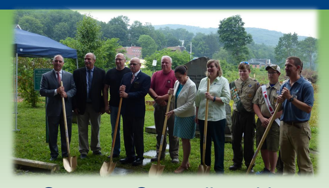
Status - Groundbreaking Event held July 13, 2017