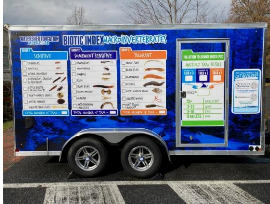
Stroud Water Research Center: Watershed Education Mobile Lab

Examples of projects funded by the DEP Environmental Education Grant Program: