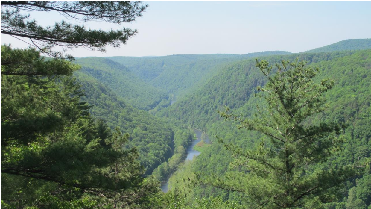
Figure 4: Pine Creek Gorge in Tioga County, Pennsylvania.