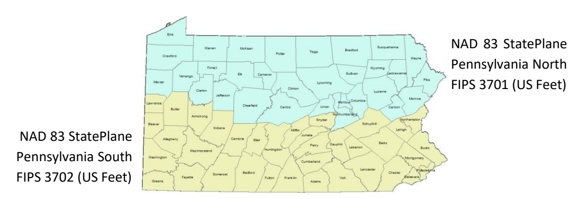
Figure 1: Shows a map of the two State Plane Coordinate System zones, showing the counties that make up each zone.