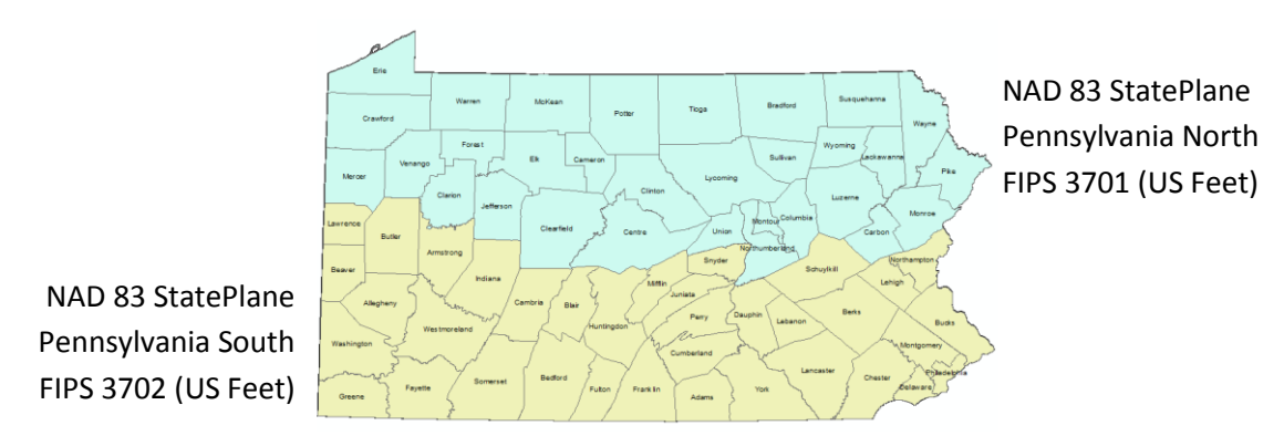
Figure 1: Shows a map of the two State Plane Coordinate System zones, showing the counties that make up each zone.