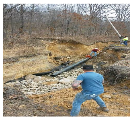
Figure 2 – End of Syphon – Valve Install