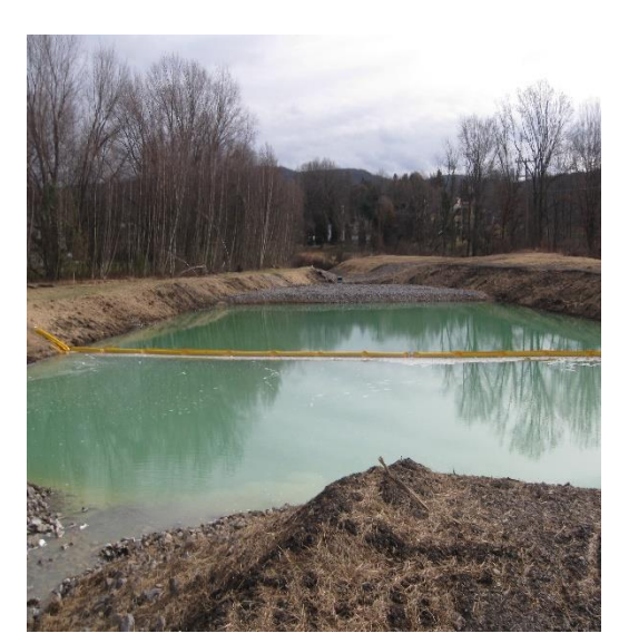
Settling Pond/Window Baffle Curtain/Horizontal Flow Limestone Bed