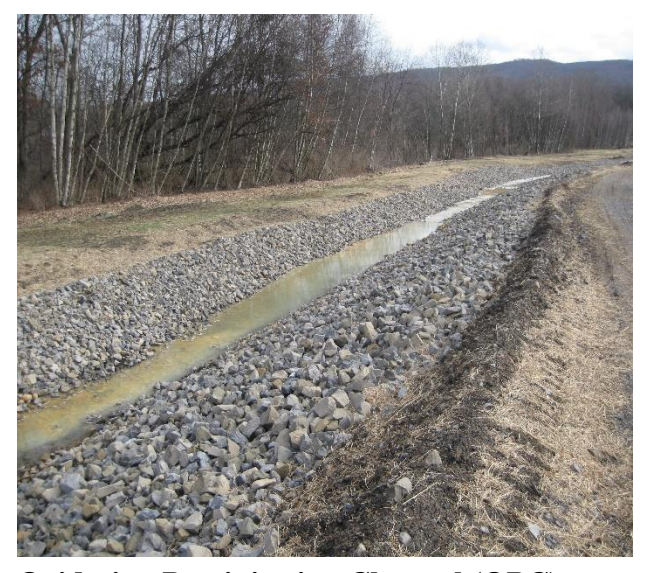
Oxidation Precipitation Channel (OPC)