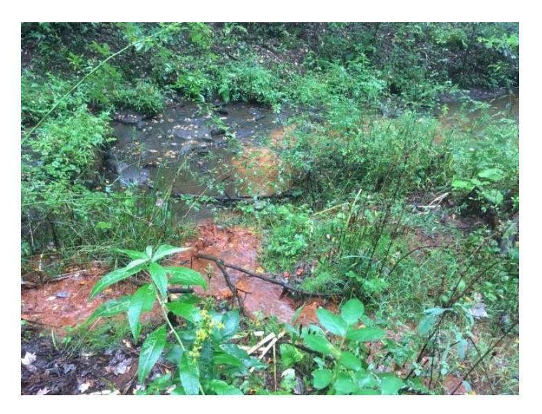
Figure 1. Stream Prior to Well Plugging (Emrick)

The gas well was successfully plugged in August 2019. Water sample results of the stream post-plugging show the iron concentration has dropped below detectable limits, the manganese is less than 1.0 mg/l and the visual improvements were immediately noticeable.