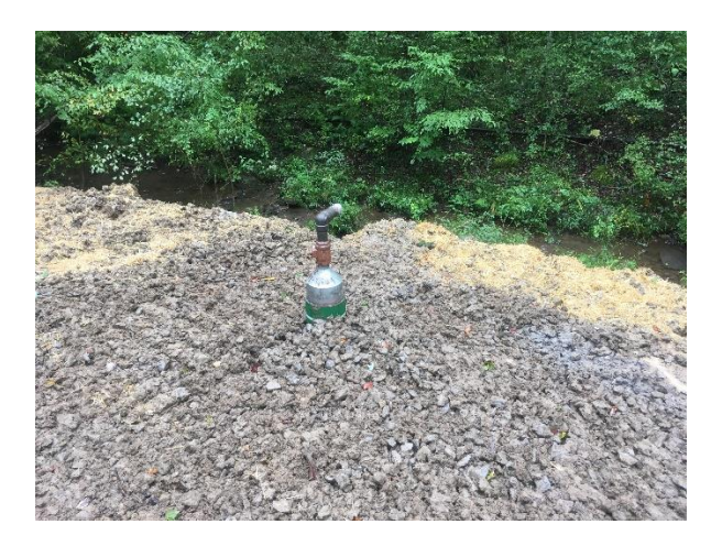
Figure 3. Plugged Well (Emrick)