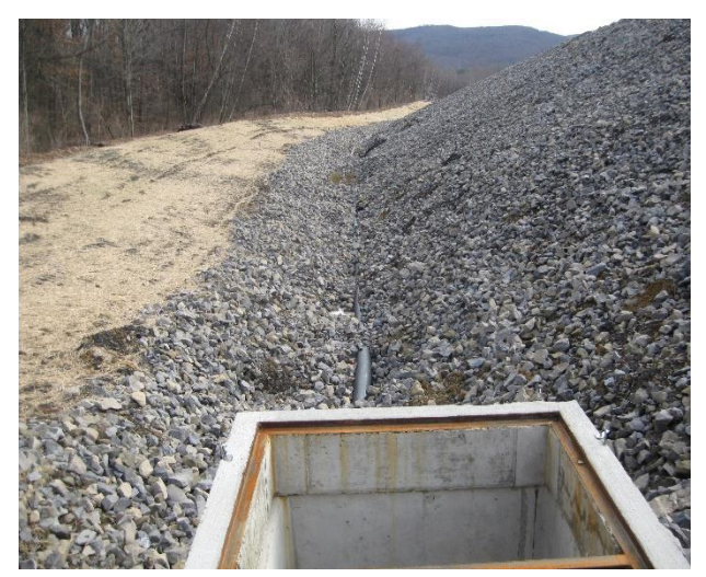
Stream Intake Flow Control System

During 2019, Stream Restoration, Inc., the recipient of a Growing Greener grant to construct a water treatment system at this site, completed the project and the new treatment system was placed online on November 30, 2019. Data collection/water sampling activities ongoing to confirm treatment system is adequately treating. Once confirmed, the Department will request removal from ABS list.