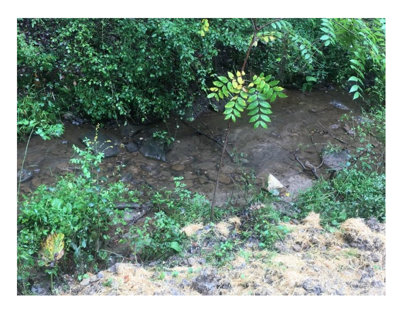
Figure 4. Stream Next to Plugged Well (Emrick)