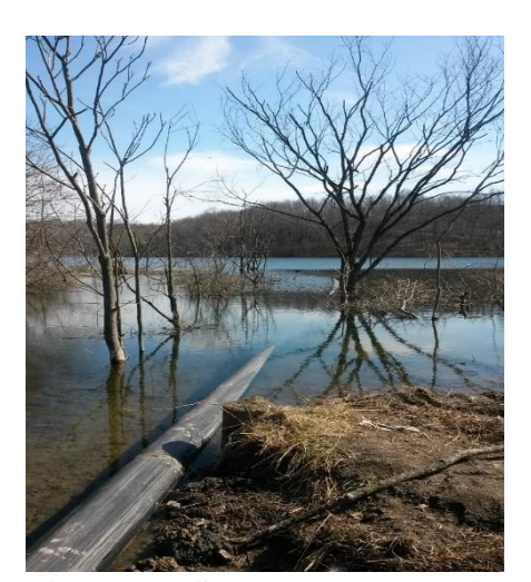
Figure 1 – Syphon and Lake (Freshwater Impoundment)