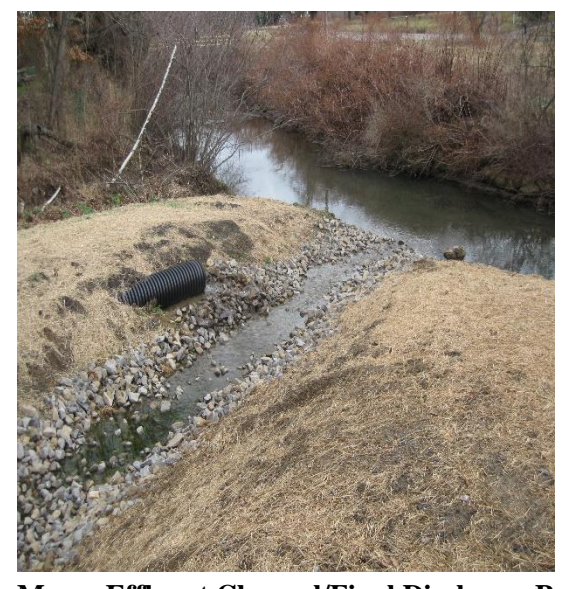
Merge Effluent Channel/Final Discharge Point