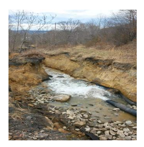
Figure 3 – Syphon Online