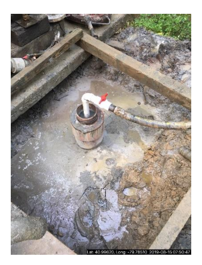
Figure 2. Well Plugging (Emrick)